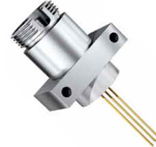
PD150-003-5xx FC Receptacle