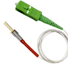
PD150-003-3xx SC/APC Pigtail